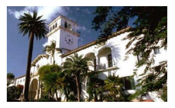
The County Courthouse is one of the architectural gems of Downtown Santa Barbara.